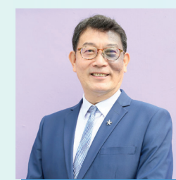
國際啟發潛能教育聯盟(香港)組織 Organization of IAIE(HK)

IAIE has a mission. It is our responsibility to further possible frontiers to regions and countries in Asia. We are to promote our practical methodology with our core values: respect, trust, optimism, care, and intentionality, which make IE so unique in establishing inviting relationships that enhance mutual development and support the unleashing untapped human potentials.